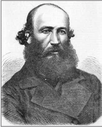
Batchelder, photographer The late Peter Snodgrass Esq., MLA Wood engraving from photograph Pictures Collection, State Library Victoria, IAN20/12/67/13 Published in The Illustrated Australian News for Home Readers , 20 December 1867