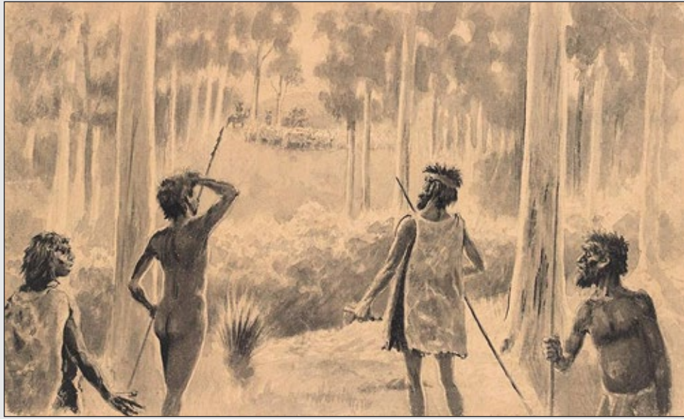
Unknown artist Aboriginal people watching sheep droving, c.1850 Ink wash over pencil Pictures Collection, State Library Victoria, H26595

w[ould] plunder or murder even those from whom they had only a few minutes previously received presents and food'. 33