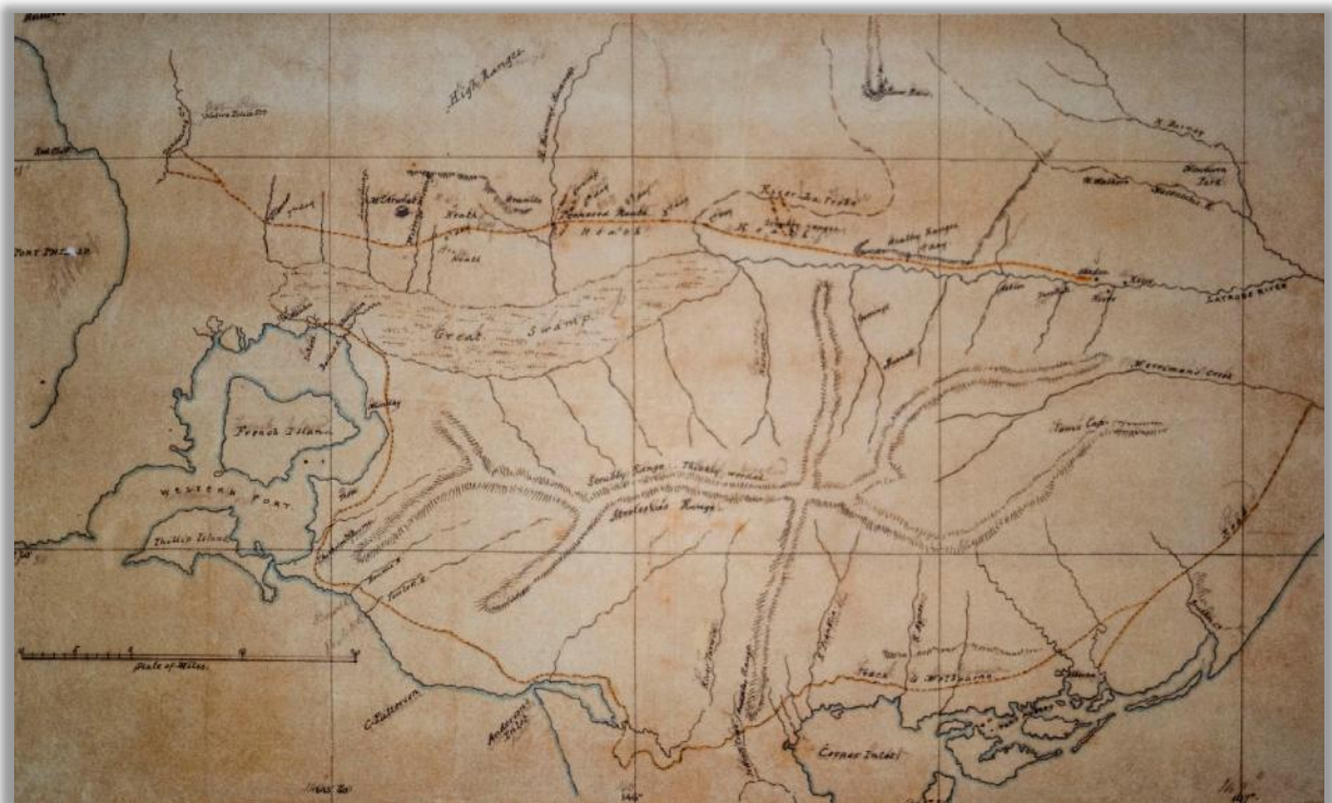
Map of Gippsland, 1845-47

Online at http://handle.slv.vic.gov.au/10381/282977