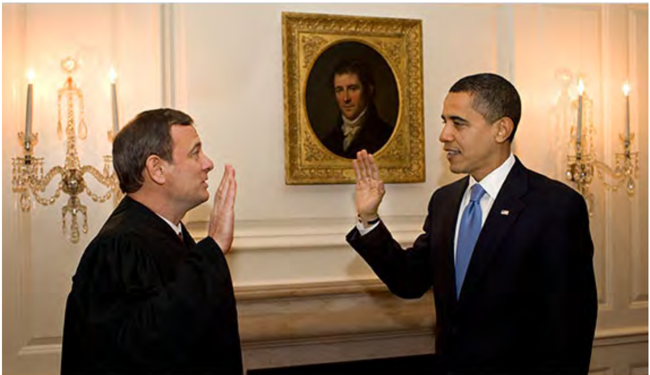
Chief Justice John G. Roberts Jr. re-administering the oath of office to Barack Obama on Wednesday in the White House.