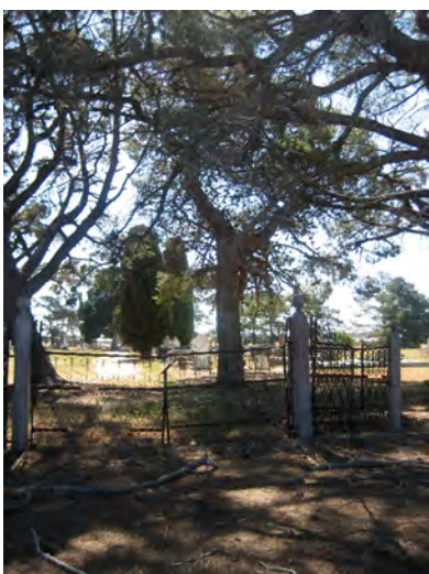
Old eastern entrance to Inverleigh cemetery

The final resting place of Charlotte Pellet is in a tranquil cemetery at Inverleigh, a rural township on the Hamilton highway 28 kilometres to the west of Geelong. The grave is within the north-eastern quarter of the cemetery, which is the Church of England section, beside a handsome Bhutan pine and alongside the original entrance road from the east, indicated by the old wrought iron gates now part of a fenced paddock. The more recent entrance to the cemetery is from the south side in Cemetery Road through later iron gates with brick pillars.