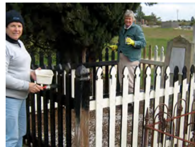
Painting working bee

A gathering will be held on 9 April 2009 at the gravesite to mark the completion of the project.