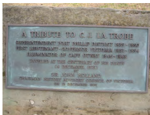
Sign at Cape Otway. Photographer: Mathilde Chevalier, February 2009 ©

Numerous place-names in Victoria have been created in honour of Charles Joseph La Trobe. Can you contribute a photograph to this ongoing series?