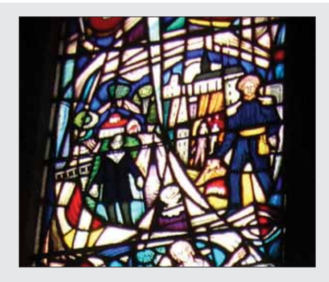
La Trobe Commemorative Window, detail Chapelle de l'Ermitage, Neuchâtel, Switzerland