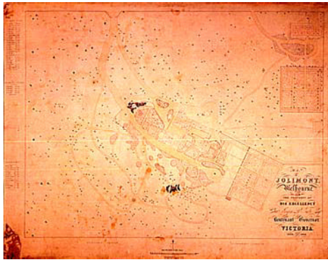
Figure 4 1854 Lithograph of Jolimont

Silver with azure front loaded with three golden shells, the shield stamped with an arm carrying an anchor.