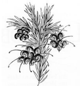
Figure 2 Grevillia Latrobeana Edward Latrobe Bateman