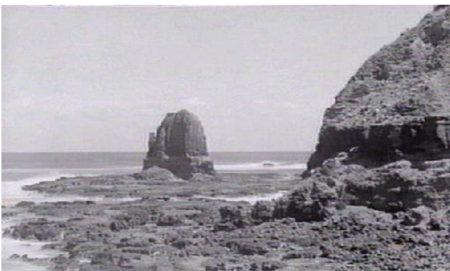
Figure 8 Photograph: Pulpit Rock

Following lunch we will drive to Cape Schanck to view Pulpit Rock and Bushranger's Bay and visit the sites La Trobe sketched.