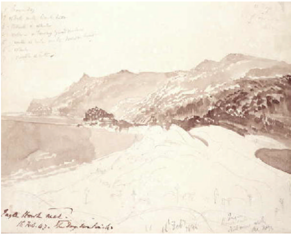
Figure 1 Charles Joseph La Trobe, Eaglehawk Neck and the Dog Sentinels