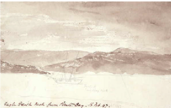
Figure 2 Charles Joseph La Trobe, Eagle Hawk Neck