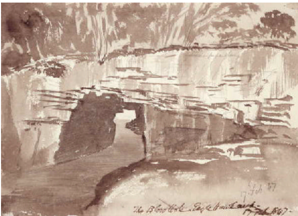
Figure 3 Charles Joseph La Trobe, Blow Hole at Eaglehawk Neck