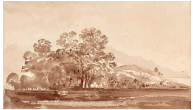
Figure 10 Charles Joseph La Trobe, English Landscape

Members are advised that the Annual Membership subscriptions for the La Trobe Society are now due. Please complete the enclosed renewal form and return it to the Honorary Treasurer with your cheque for $25 (individual) or $40 (families), as soon as possible to: PO Box 65 Port Melbourne 3207.