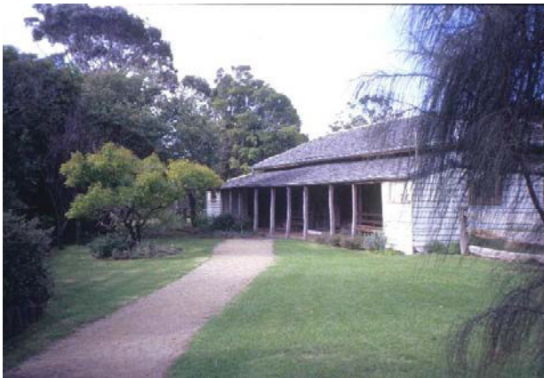
Figure 7 McCrae Homestead

Our first stop is the McCrae Homestead for a tour which is followed by lunch.