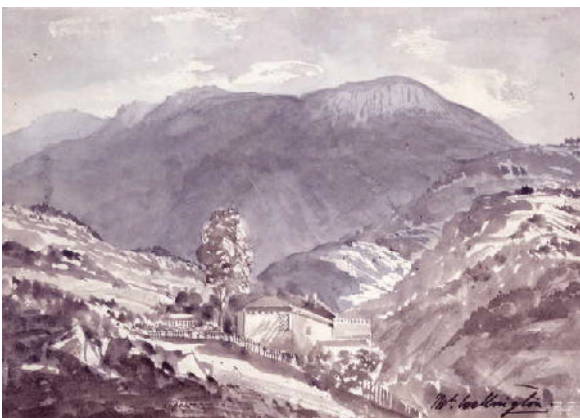
Figure 4 Charles Joseph La Trobe, Mt Wellington