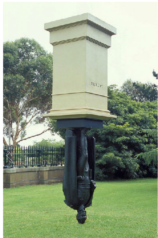
Figure 5 Landmark by Charles Robb

As part of the Landmark exhibition, Dr Dianne Reilly will speak about La Trobe at the function on 25 October. The Cost of $10.00 for each session includes Museum entry.