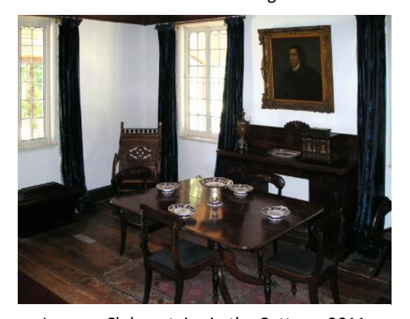
Lyceum Club curtains in the Cottage, 2011

Recently, when items stored in the loft above the reception area were being sorted through, several bags of curtains were found to have been stored there. These are curtains which hung in the Cottage for a number of years, but have now been replaced. The four pairs of floral curtains which were in the bedroom until early 2015 when Lorraine Finlay arranged for their replacement, were found to have dry cleaning stickers dated December, 1980 which indicated that they had come from Como. There were the three pairs of blue velvet curtains which hung in the Dining Room until 2011. These had originally been in the private residence of Sir George Verdon over the E S & A Bank in Collins Street which later became the headquarters of the Lyceum Club.