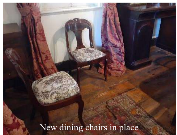
New dining chairs in place

The Cottage will be open every Sunday now from 1-4pm. Helen Armstrong has been in touch with NTAV Marketing and these Sunday openings (together with Australia Day on 26 January) are now available to book on Eventbrite, see https://open-day-la-trobes-cottage.eventbrite.com.au I will be sending out the request for volunteers for December soon. The requirement for a Covid Marshal, to check visitors' vaccination certificates, means an extra volunteer is needed every Sunday and therefore we might call upon some volunteers to offer two Sundays in the month if you are available.