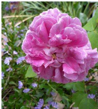
Baronne Prevost at La Trobe's Cottage

Only one of our new roses (two varieties on the 1851 list from Camden Nursery, sourced from South Australia) bloomed this year – 'Baronne Prevost'. I spotted the same variety in the rose garden at Como recently - it was quite a large bush and flowering well, so if our four new roses grow as well as this one, that bed will provide quite a show in coming years. Gardeners please note that I'll be suggesting we meet on Tuesday 14 December as the third Tuesday (21 st ) is a little close to Christmas.