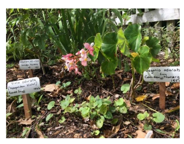
Special plants labelled

We are planning to promote Garden Tours next Spring – Working Bees will continue over the winter to ensure the garden looks its best for our opening Garden Day on 2 October. We welcome our new garden volunteer, Pamela Jellie, who will provide invaluable advice and support.