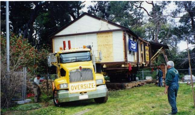
Moving day 1998, State Botanical Collection, Royal Botanic Gardens Victoria.

We'll keep in touch over the winter and will arrange our pre-season meeting in September, ready for our Garden Day Opening on 2 October.