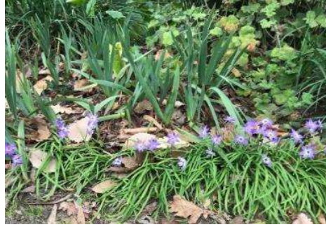
Ipheion (Spring Starflower)