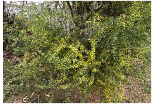
Acacia latrobei (truly 'Gold Dust Wattle')

Now take a seat under the watchful eye of the perky aloe