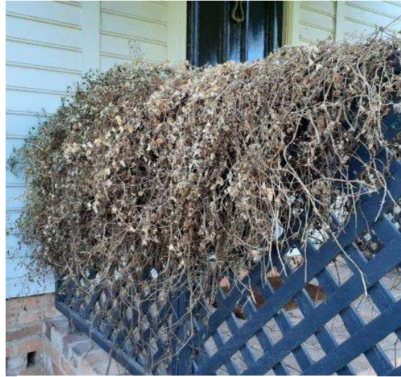
Maurandya barclayana September 2021

The four heritage roses (2 x Coupe' d'Hébé and 2 x Baronne Prévost) arrived just in time to get them planted before the lockdown which started on 5 August. They are just starting to shoot.