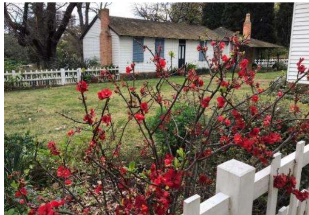
Chaenomeles (Flowering Quince)