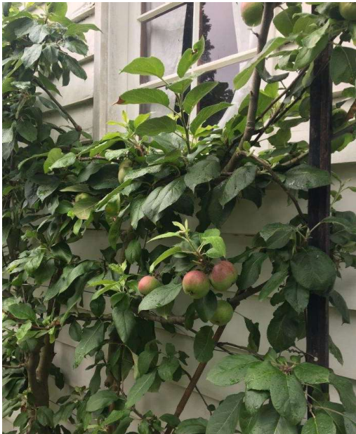
Apples January 2023

After a promising start to the cropping season, when the apples fruited well in response to Chris England's expert pruning, sadly all the apples were gone by harvesting time. While it was clear earlier on that the possums had enjoyed a few, a more sinister cause for their complete disappearance over a few days was unfortunately apparent.