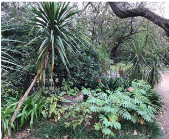
Melianthus and cordyline

Garden Volunteer Ellen took some photos of the (nearly) Spring garden as she walked past La Trobe's Cottage in lockdown.