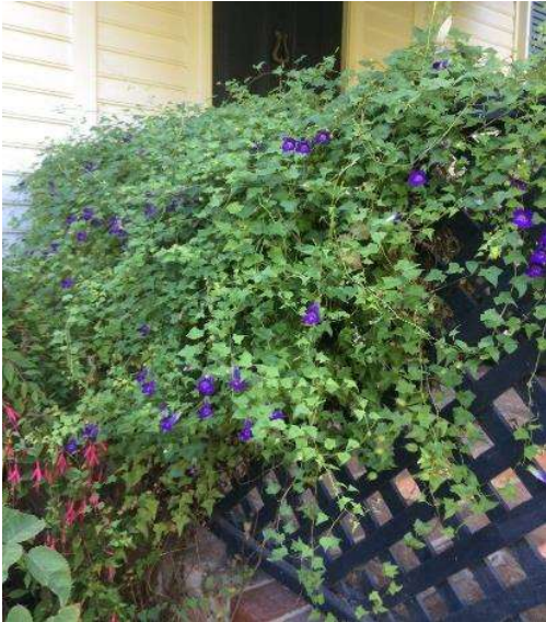
Maurandya barclayana November 2020